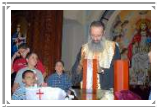
On September 10th of 2009, the church celebrated the arrival of the Relics of: St. George, Martyrs of Fayoum, Martyrs of Ansena, and Children of Abba Thomas the Anchorite.